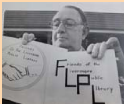
The Friends of the Livermore Library original logo.

FOLL is only as strong as its members and patrons. Through annual memberships, donations (books, DVDs, CDs and monetary), grants and the patronization of the bookstore, FOLL can continue its mission to support the Library and its services and programs. It does this by advocating for public support, by generating funding (both current and long-term) and by developing volunteer involvement.