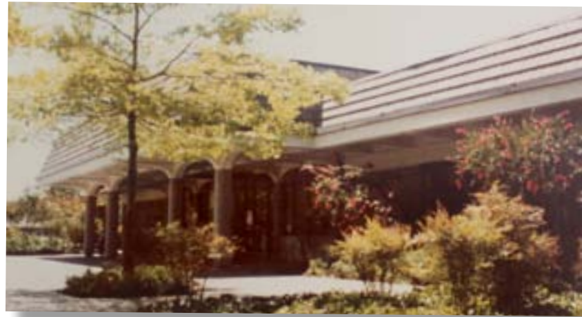
Old Civic Center library