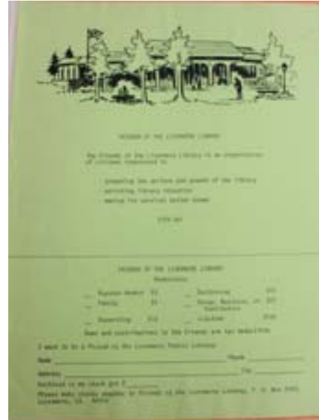
First Membership Form