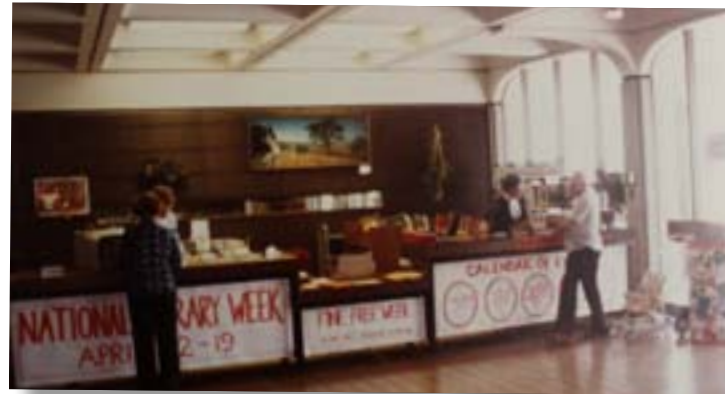
Front desk at the old Civic Center library