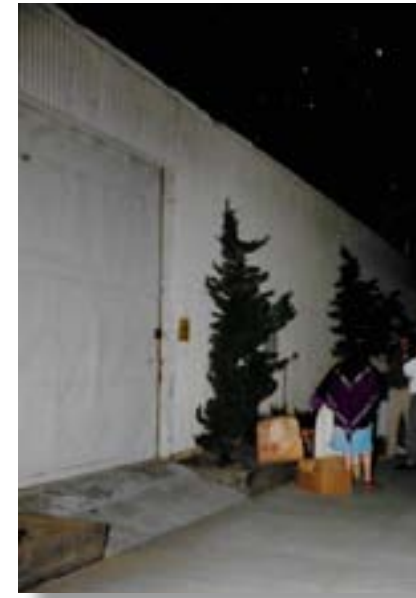
Book sale at the Barn